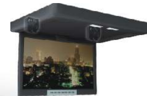
Multimedia Entertainment System