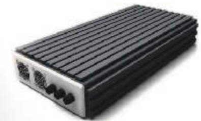
Audio Amplifier Amd DC/AC Inverter