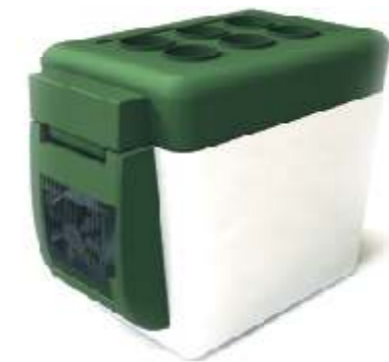
Mobile Refrigeration With Bottle Cooler