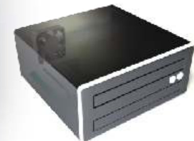
Car Computer System