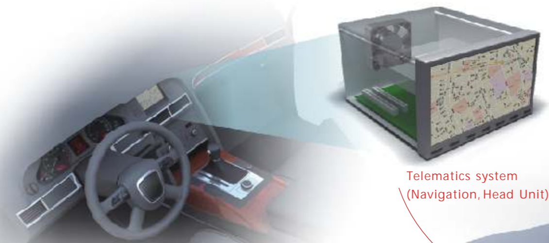
Telematics system (Navigation, Head Unit)

Y.S. TECH has many years of experience working in both the North American and European Automotive Markets. Utilizing our core technologies of CFD simulations, Psycho-Acoustic Analysis, Multi-function control system, mechanical expertise, and overall system integration we are able to develop optimal cooling solutions for customers in one of many different applications. Telematics Systems(Navigation, Audio Amplifiers, DVD and Head units), Seat heating and cooling, Hybrid Driving System (Fuel Cell-Gasoline), LED lighting and more are just a few of the applications Y.S. TECH can help solve thermal management problems. Our goal is to provide a cooling system that is unsurpassed in reliability, quality and performance giving the driver & passengers the most comfortable driving experience.