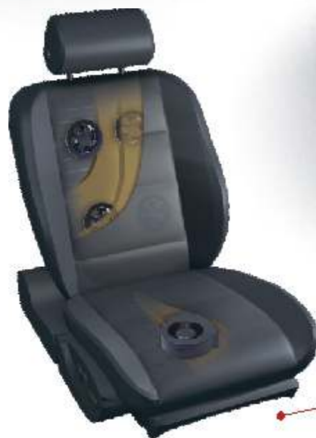
Car Seat Heating /cooling System